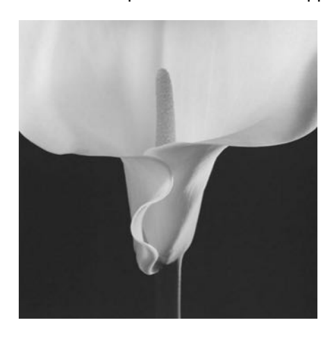
Calla Lily, 1988

Identical self-portraits of Robert Mapplethorpe with trip cable in hand, 1974