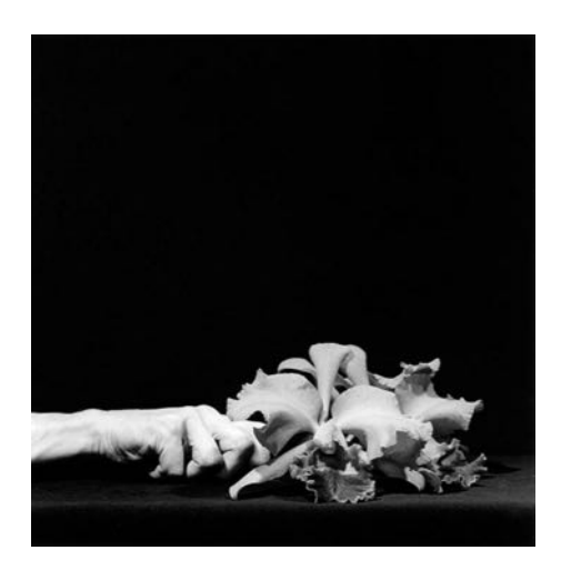
Orchid and Hand Robert Mapplethorpe, 1983 20" x 16", silver gelatin print